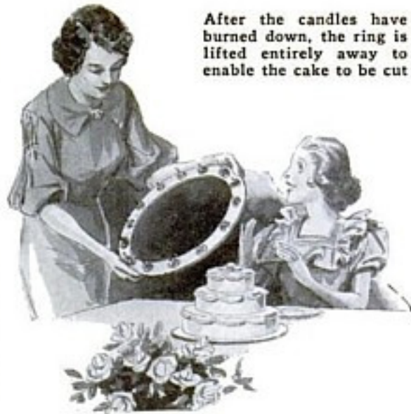
Left - Cake board with holes drilled around edge for candles Popular Mechanics (May 1915)