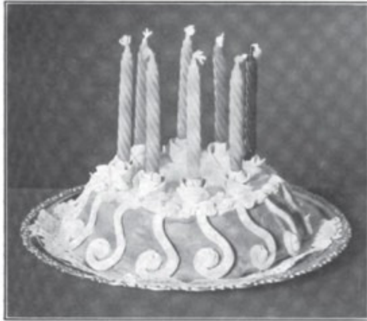
Decorated cake with piped frosting & rosebud candle holders served on a silver platter. Boston Cooking School Magazine (Mar 1906)

The sponge cake became the favored child's birthday cake. This separated it from the butter based fruit cake which also became a favored cake for use as a birthday cake presumably for adults.