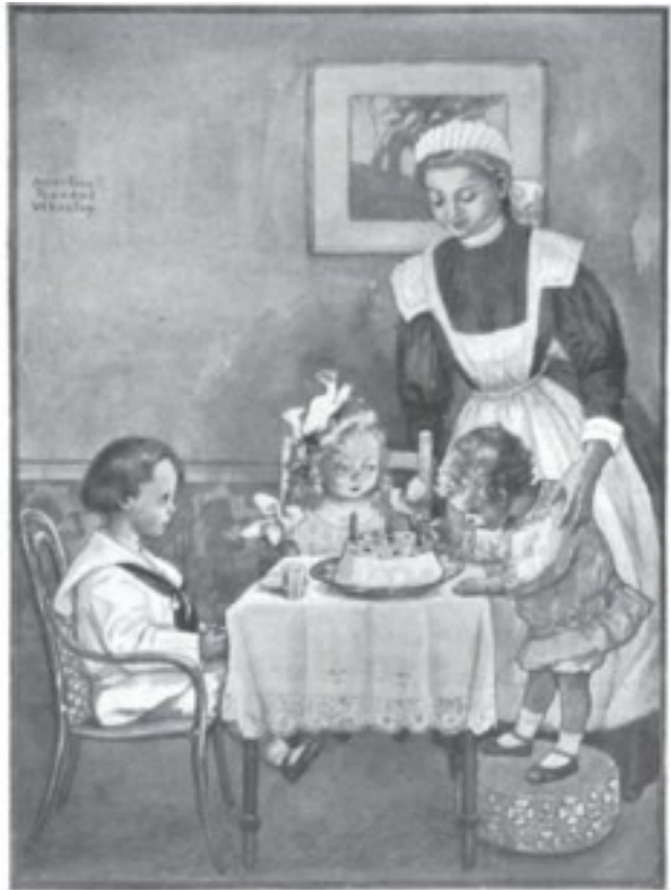
Birthday Party from St. Nicholas (1909)

She explained a large cake was to be baked in the "dripping pan and heavily frosted." When the frosting was partially dried "mark it off in small squares and put half an English walnut meat on each." The next step was to cut a narrow "paste-board" [cardboard] frame to go around the edge. Small holes were cut in the paste-board to hold the candles. To dress up the frame, fancy colored paper was added. Then she explained how it was to be served. "The lights in the room should be put out and the cake brought in with candles lit and placed before the person whose natal day is being celebrated and he should cut and distribute it." (p.462)